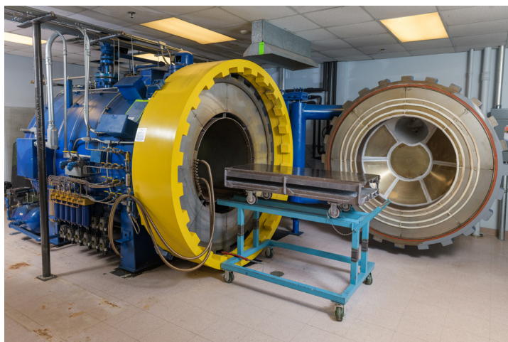
TEC – 1000°F, 515 psi Processing Autoclave

Related continuing education opportunities include Engineering Outreach and CCM workshops, symposia, and seminar series.