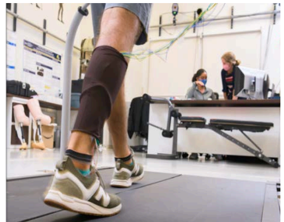
Patented nanocomposite sensor with integrated AI-enabled data analytics for physical rehabilitation