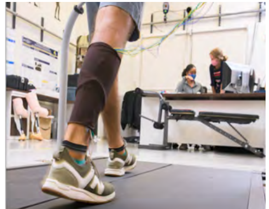
Patented nanocomposite sensor with integrated AI-enabled data analytics for physical rehabilitation